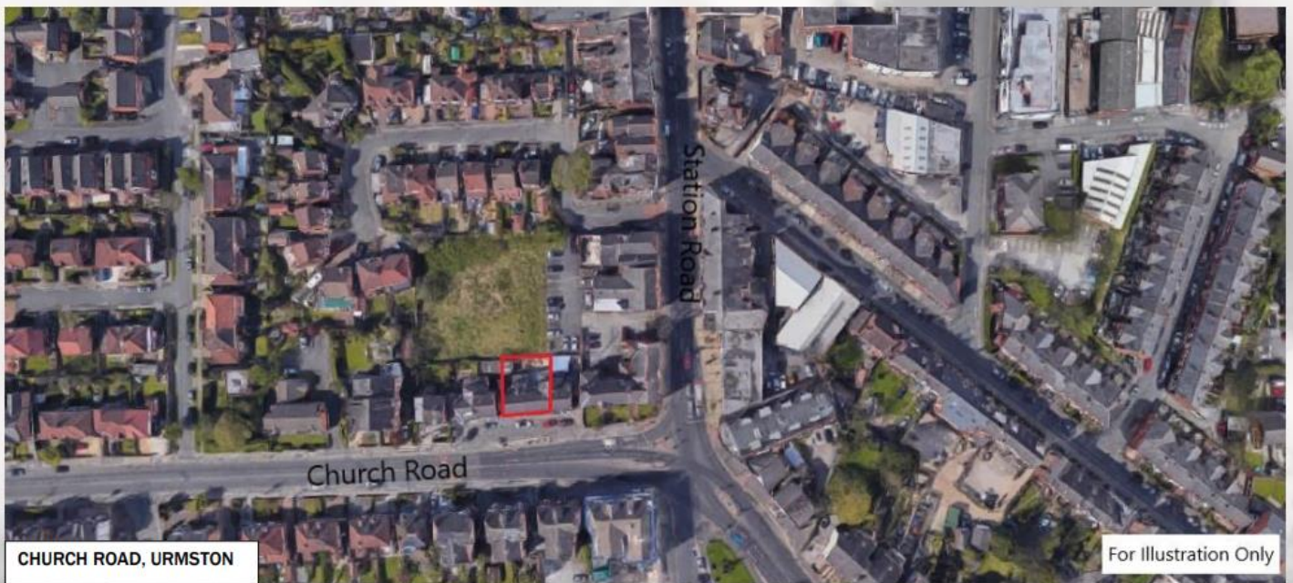
CHURCH ROAD, URMSTON

The properties are located on the north side of Church Road, not far from its junction with Queens Road in Urmston, Manchester. Urmston Town Centre including all shops, bars, restaurants and transport links is within close proximity. Urmston is an increasingly popular Manchester suburb situated approximately 5 miles south west of Manchester City Centre.